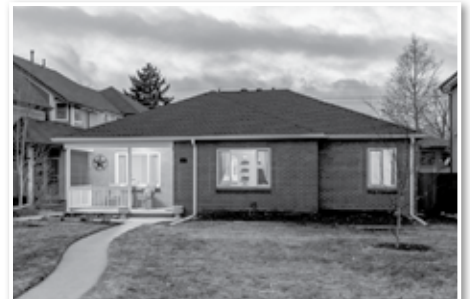
1355 S. SAINT PAUL STREET Sold for $622,500 | Represented Buyer