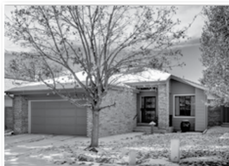
3333 E. FLORIDA AVENUE #21 Sold for $599,000 | Represented Seller