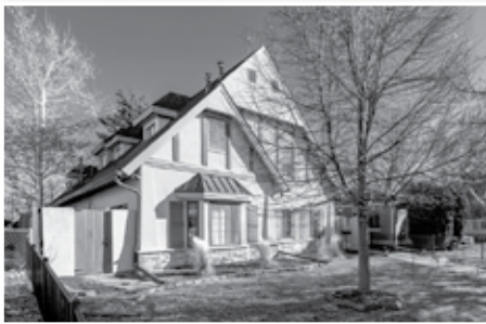
1280 S. SAINT PAUL STREET Sold for $1,110,000 | Represented Seller