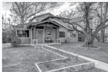
1415 S. MILWAUKEE STREET Sold for $976,500 | Represented Seller