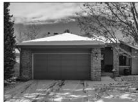
3333 E. FLORIDA AVE