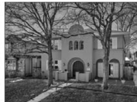
1635 S. MADISON ST