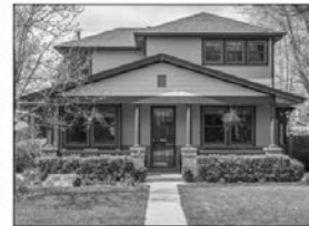
1315 S. SAINT PAUL ST