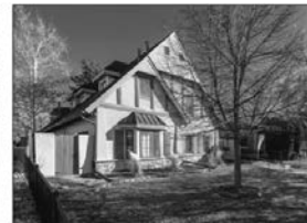
1280 S. SAINT PAUL ST