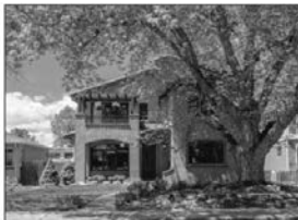
1327 S. SAINT PAUL ST