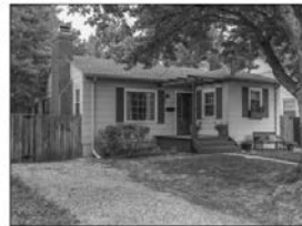
1545 S. COLUMBINE ST