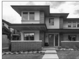
1466 S. FILLMORE ST