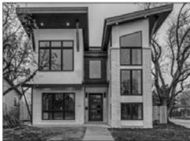
1105 S. MILWAUKEE ST