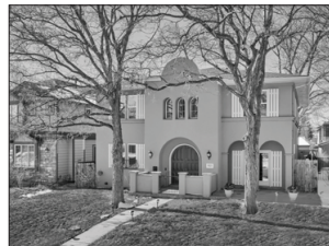
1635 S. MADISON ST