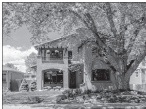
1327 S. SAINT PAUL ST