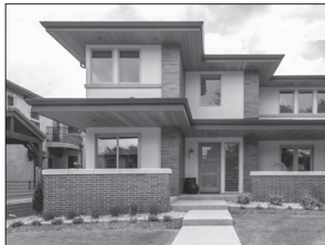
1466 S. FILLMORE ST