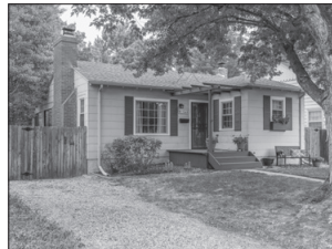
1545 S. COLUMBINE ST