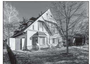
1280 S. SAINT PAUL ST