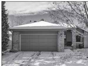
3333 E. FLORIDA AVE