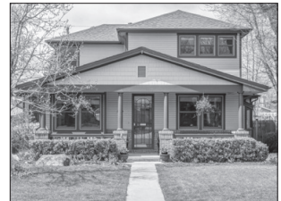
1315 S. SAINT PAUL ST