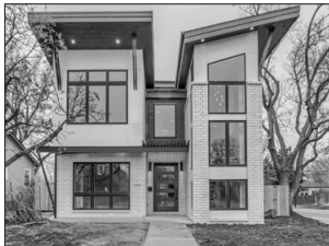
1105 S. MILWAUKEE ST