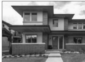
1466 S. FILLMORE ST