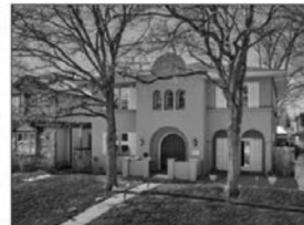
1635 S. MADISON ST