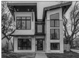
1105 S. MILWAUKEE ST