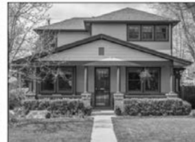
1315 S. SAINT PAUL ST