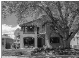
1327 S. SAINT PAUL ST