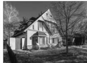
1280 S. SAINT PAUL ST