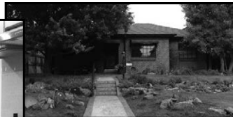
Replace the grass

Upcoming Quarterly Neighborhood Meetings To Be Held at Kirk of Bonnie Brae, Corner of Arizona & Steele