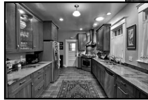
Add a dining nook or remodel your kitchen

The photos attached are just some examples of remodeling that could add value to your home, provide more family-friendly space and help you keep most of the equity you already have.